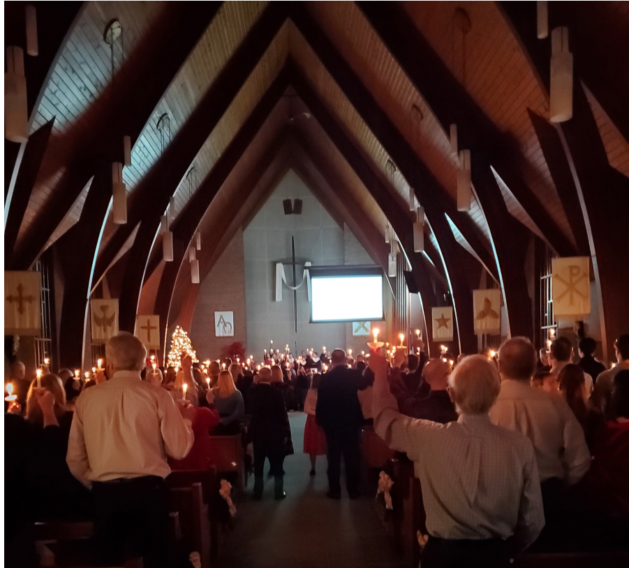
Photo from Christmas Eve 7pm Service

Take your light into the world and let it shine!